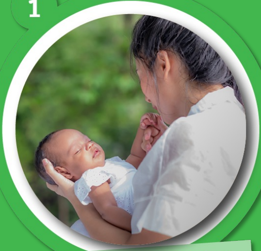
Hawai'i Maternal and Infant Health Collaborative (HMIHC)