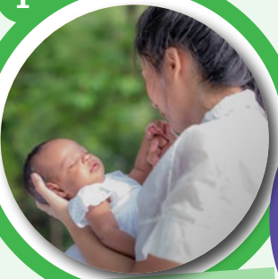
Hawai'i Maternal and Infant Health Collaborative (HMIHC)

Team 1 / HMIHC is working to improve maternal and infant health outcomes while advancing health equity and reproductive justice.